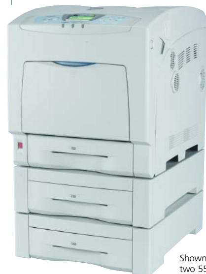
Shown here with two 550 sheet optional trays

Specifications subject to change without notice